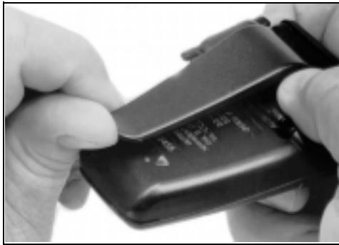
Opening the battery cover.

If your pager is equipped with the "Out of Range" feature, and if you are outside the coverage area of your paging transmitter, the "∇" symbol appears in the upper left corner of the display to inform you that you are out of range. As long as the out of range symbol is displayed, you will be unable to receive any pages.